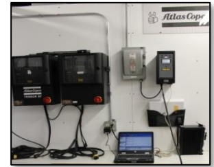
Atlas Copco Test Area