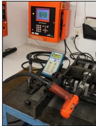
Cooper Tool Testing