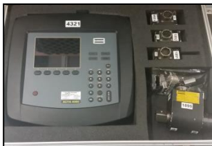
Atlas Calibration & Test Equipment