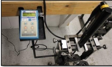
Atlas Copco QST Tool Test