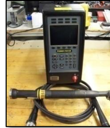
Atlas Copco ETV-ST61-50-10 PF4000 with Silver RBU TensorST 5M Tool Cable