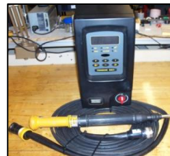
Atlas Copco ETD-D37-30-10 Compact DS7 Controller DS 10M Tool Cable