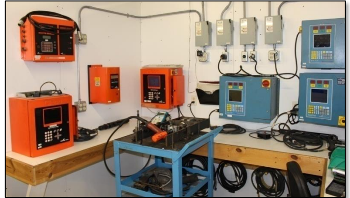
Cooper Test Area