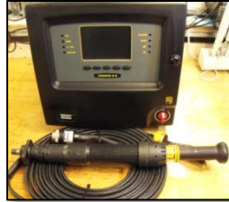
Atlas Copco ETD-S9-200-13 PF3109 Graphing with Silver RBU Tensor 10M Tool Cable