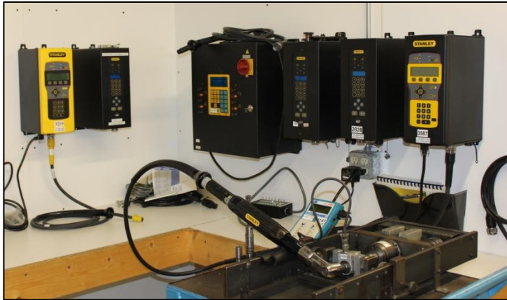
Stanley Family of Controllers

QPM EC Series Tools: 02, 12, 22, 33, 34, 44