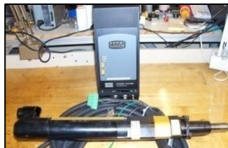
Atlas Copco QMX50-15RT Power Mac TC52 Stand Alone 10M QMX Tool Cable