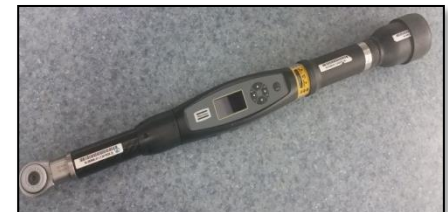
Atlas Copco Calibration Test Equipment