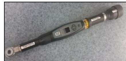
Atlas Copco Calibration Test Equipment