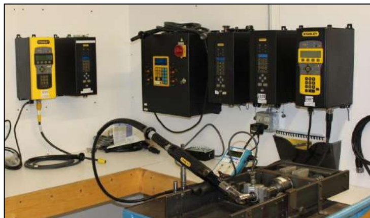
Stanley Family of Controllers

QPM EC Series Tools: 02, 12, 22, 33, 34, 44