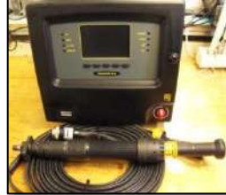
Atlas Copco ETD-S9-200-13 PF3109 Graphing with Silver RBU Tensor 10M Tool Cable