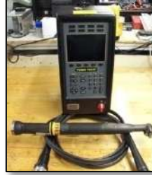
Atlas Copco ETV-ST61-50-10 PF4000 with Silver RBU TensorST 5M Tool Cable