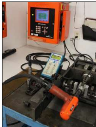
Cooper Tool Testing