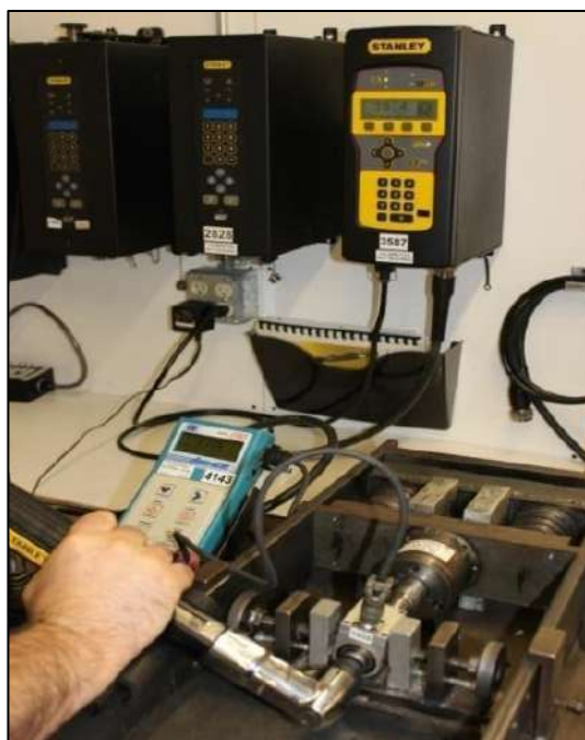
Stanley Gen IV with Test Stand