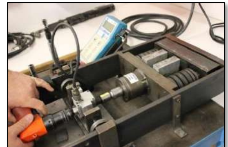
Cleco Tool Testing