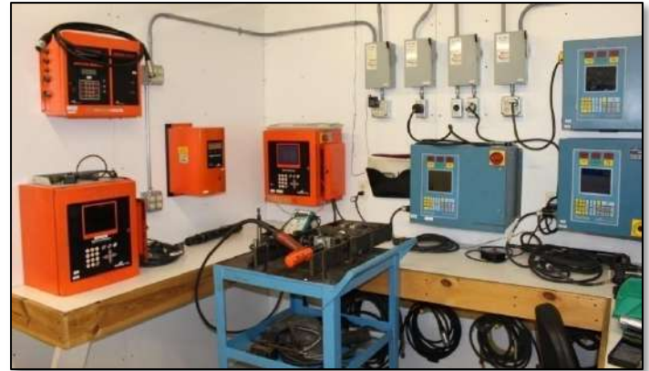
Cooper Test Area