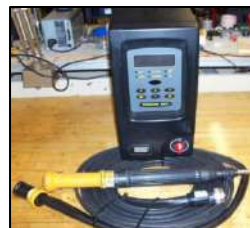
Atlas Copco ETD-D37-30-10 Compact DS7 Controller DS 10M Tool Cable