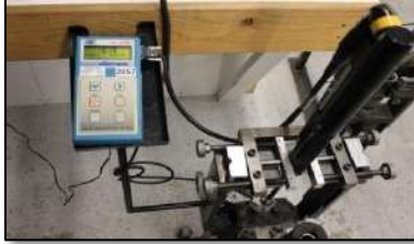
Atlas Copco QST Tool Test

ISO/IEC 17025 Calibration Laboratory / ANSI Z540 Calibration Laboratory