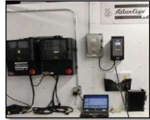
Atlas Copco Test Area