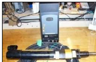
Atlas Copco QMX50-15RT Power Mac TC52 Stand Alone 10M QMX Tool Cable