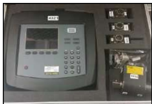
Atlas Calibration & Test Equipment